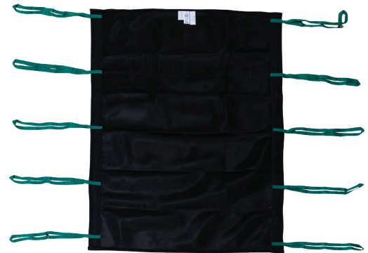
Spacer Fabric Black Turning & Repositioning Sheet