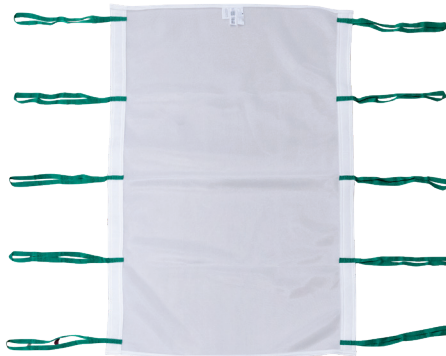
Spacer Fabric White Turning & Repositioning Sheet