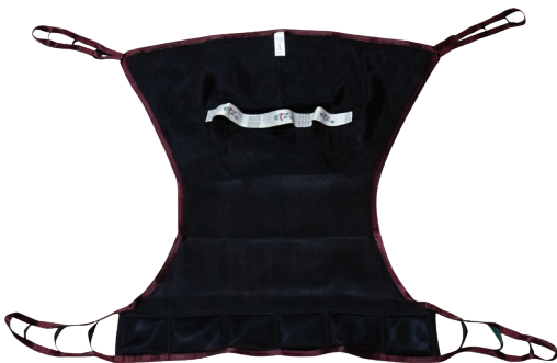
Spacer Fabric Black Hourglass w/ Head Support