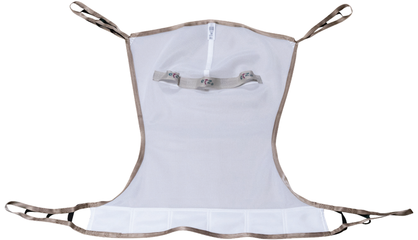
Spacer Fabric White Hourglass w/ Head Support

Shown in studies to be the most effective in reducing peak pressures, and more likely to reduce the risk of pressure ulcer development if left under the patient.*