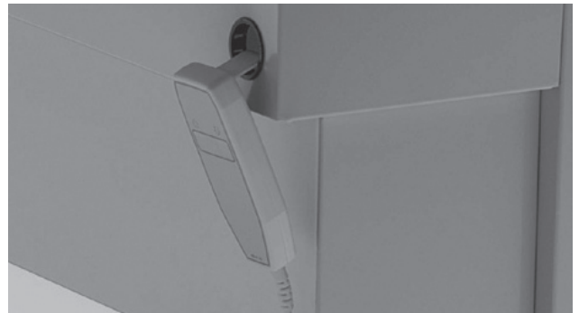
Figure 1 - Hand Control

Raise or lower the bathtub to a comfortable height by pressing the up and down buttons on the hand control. The bathtub can be adjusted to any level from 26" to 38" above the floor. To lower the bathtub, press and hold the down button. To raise the bathtub, press and hold the up button. When releasing the up or down buttons, the bathtub will stop. The hand control can be stored in the hole on either side on the bathtub.